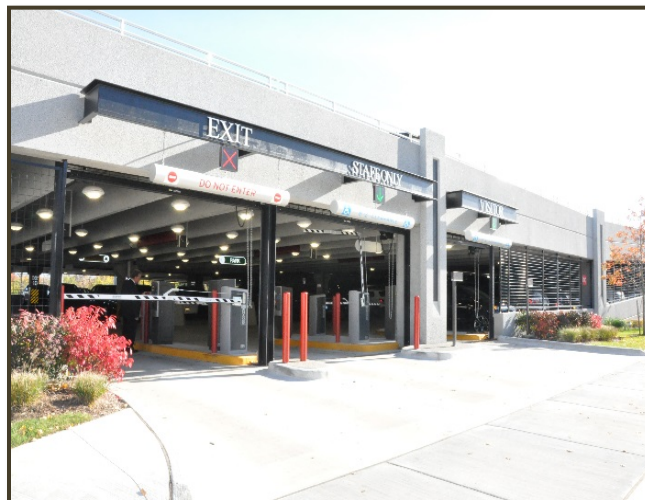
Parking structure southbound Main St

PARK AND RIDE - You can park and ride a shuttle bus through Mount Clemens Dial a Ride for $1 each way that will drop you off on North Main Street between the Court and County Buildings. The shuttle bus parking lot is located on North River Road (across from "Clinton River Cruises").